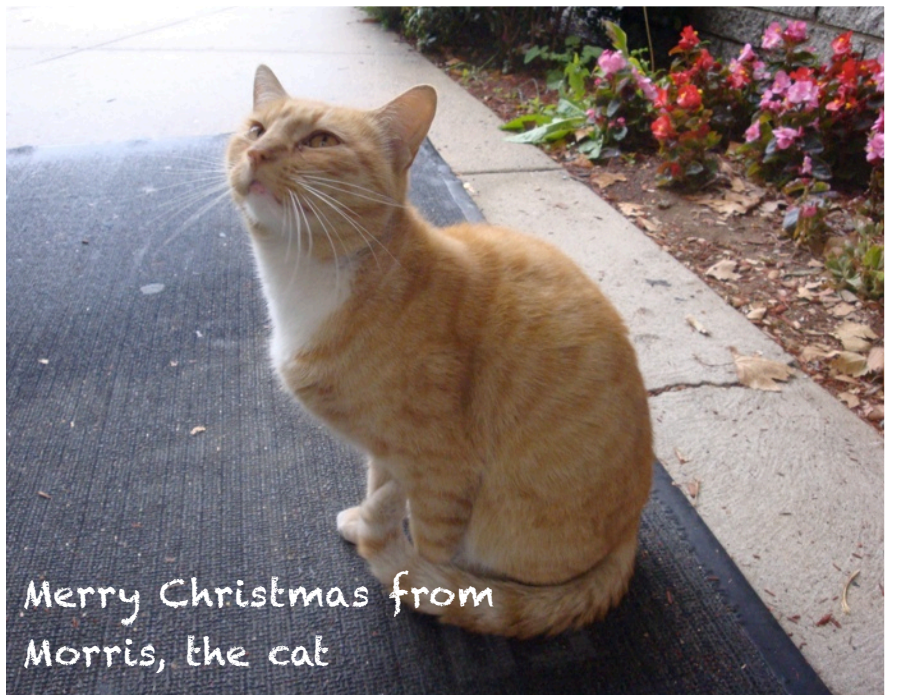
Merry Christmas from Morris, the cat